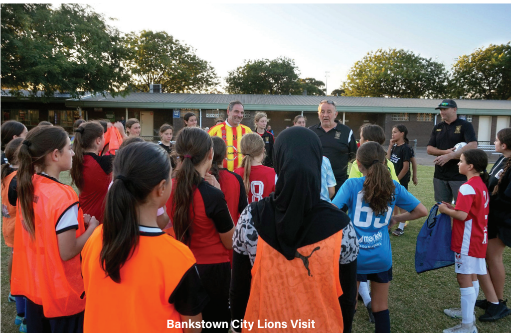
Bankstown City Lions Visit

It is heart-warming to see the unwavering level of generosity, kindness, and commitment to the well-being of everyone in the way we continue to support those in need. As a community, we are thriving because of our incredible hard work and dedication. Thank you for being a part of this caring and supportive community. After the challenging two years we've had, this year it was wonderful to attend many community events and school presentations. I want to thank our teachers and school staff for their commitment and drive to educate our young people. I have also had the opportunity to visit local