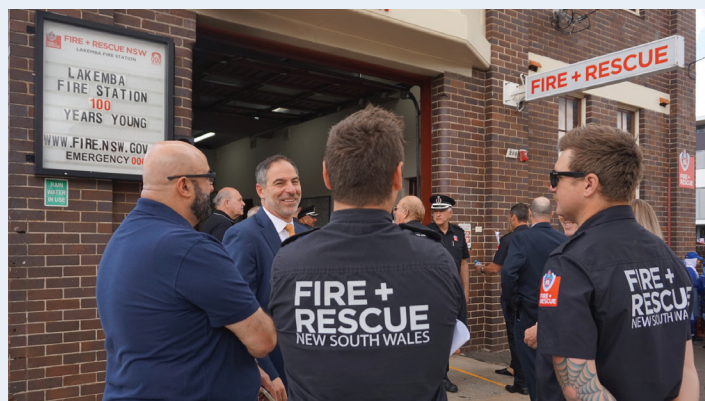
Lakemba Fire Station 100th Birthday