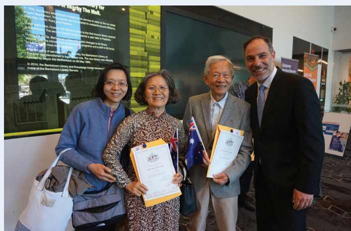
CBC Citizenship Ceremony