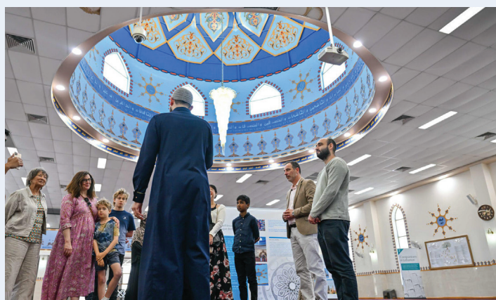
Lakemba Mosque Open Day