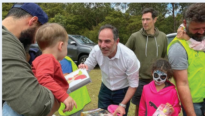
Christmas Picnic with Lighthouse Community Services, Sydney Tree Company, Toy Master Australia and Creating Links